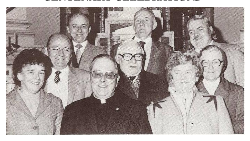
The Friends of St. Agatha's Executive Committee 1983

To mark the centenary of our Church an exhibition will be held tracing the history of the parish over the past one hundred years.