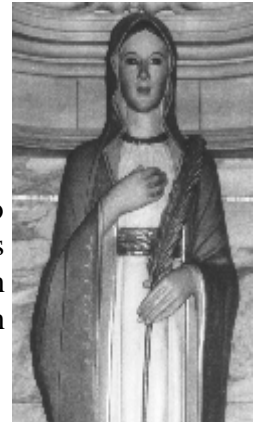
Shrine of St Agatha, North William Street

Masses for the Feast of St. Agatha are at 9.00a.m., 10.00 a.m. and 7.30 p.m. (St. Agatha's Parish Choir)