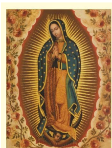
Our Lady of Guadalupe, Pray for us!

In conjunction with the Missionaries of Charities of Calcutta